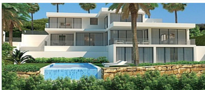
VILLA 1A 1311.35 m 2 4 10 x 4 514 m 2 4 2