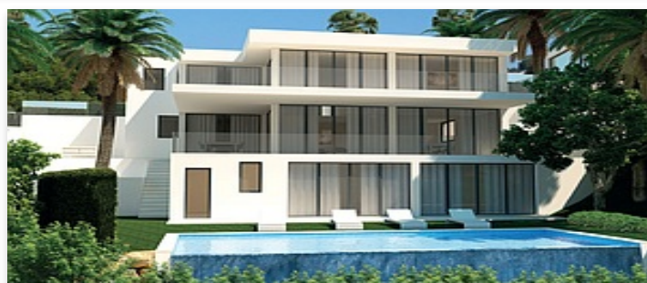
VILLA 1B 1311.35 m 2 4 10 x 4 459 m 2 4 2