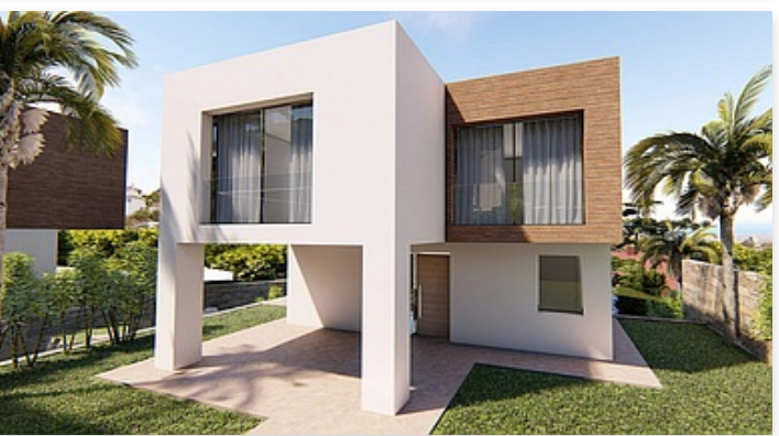
Contemporary villas located in a residential complex with sea views in Mijas Pueblo

Location: Mijas Price: 845,000 € - 1,125,000 €