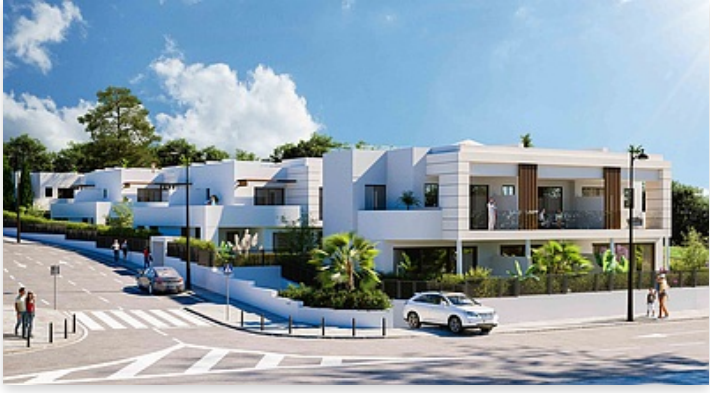
Semi-detached houses in a gated community in Cancelada, Estepona